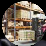
LOGISTIC AND WAREHOUSING